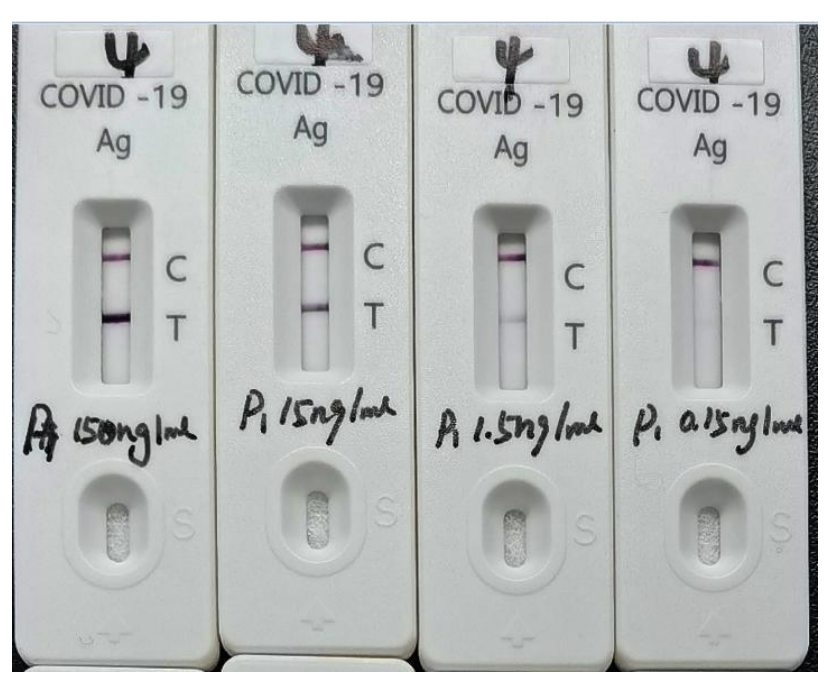
N Recombinant Protein of wild strain