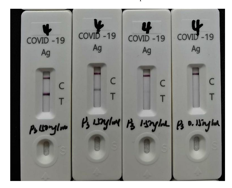
Detla-mutant N recombinant protein