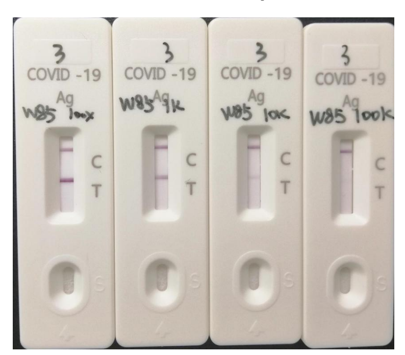
Omircon-mutant N recombinant protein