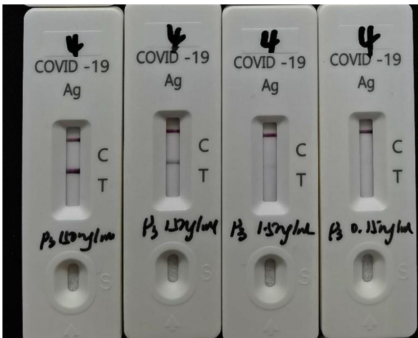
Delta-mutant N recombinant protein