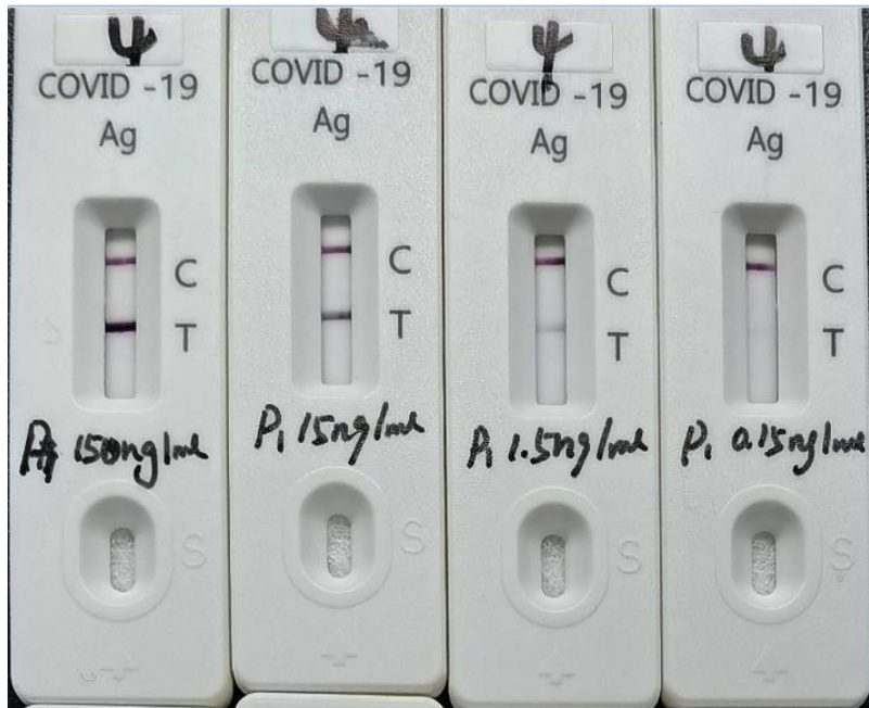
N Recombinant Protein of wild strain