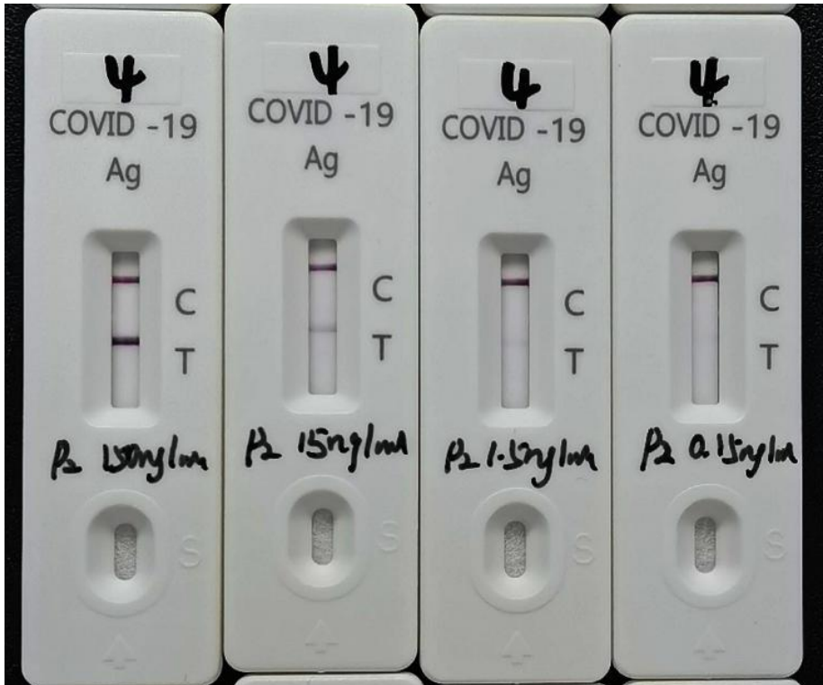
\alpha -mutant N recombinant protein